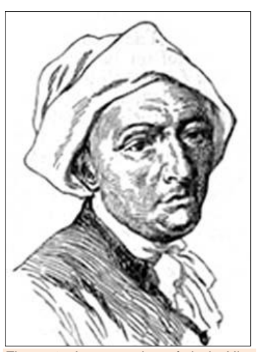
Figure 2: An engraving of de la Hire made during his lifetime.

LY-EY = 354.36700 - 346.61979 = 7.74721 days