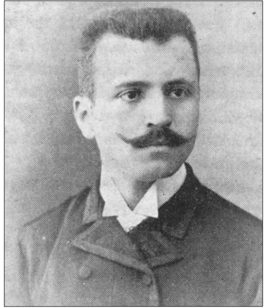
Figure 4: Eginitis as an astronomer in Paris (courtesy: Institute of Astronomy and Astrophysics, National Observatory of Athens).