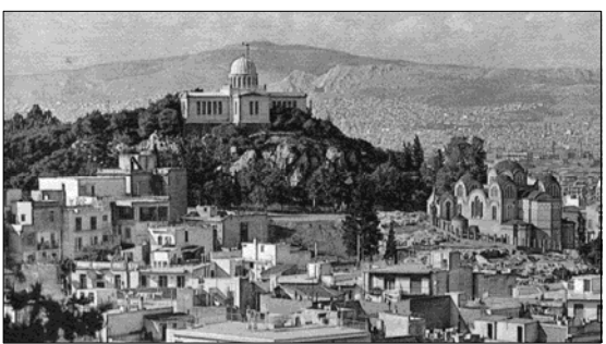
Figure 1: The National Observatory of Athens.

Schmidt (Figure 2) was distinguished as an Assistant to Friedrich Wilhelm August Argelander (1799– 1875), the creator of Bonner Durchmusterung catalogue (1859-1862). In 1858 Schmidt accepted the offer by Baron Simon Sinas and became the second Director of the Observatory, with a monthly salary of 1,000 drachmas, paid by Baron Sinas (Plakidis, 1960).