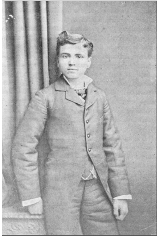
Figure 3: Eginitis as a student (courtesy: Institute of Astronomy and Astrophysics, National Observatory of Athens).

Eginitis immediately began developing and applying his program, slowly but systematically working his way through the many obstacles imposed by the political strife of the period and the usual bureaucracy.